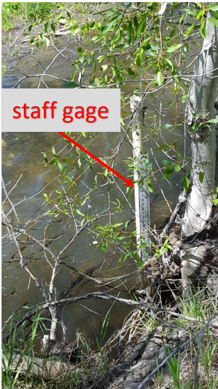
Fig.2. Staff gage attached to stilling well.