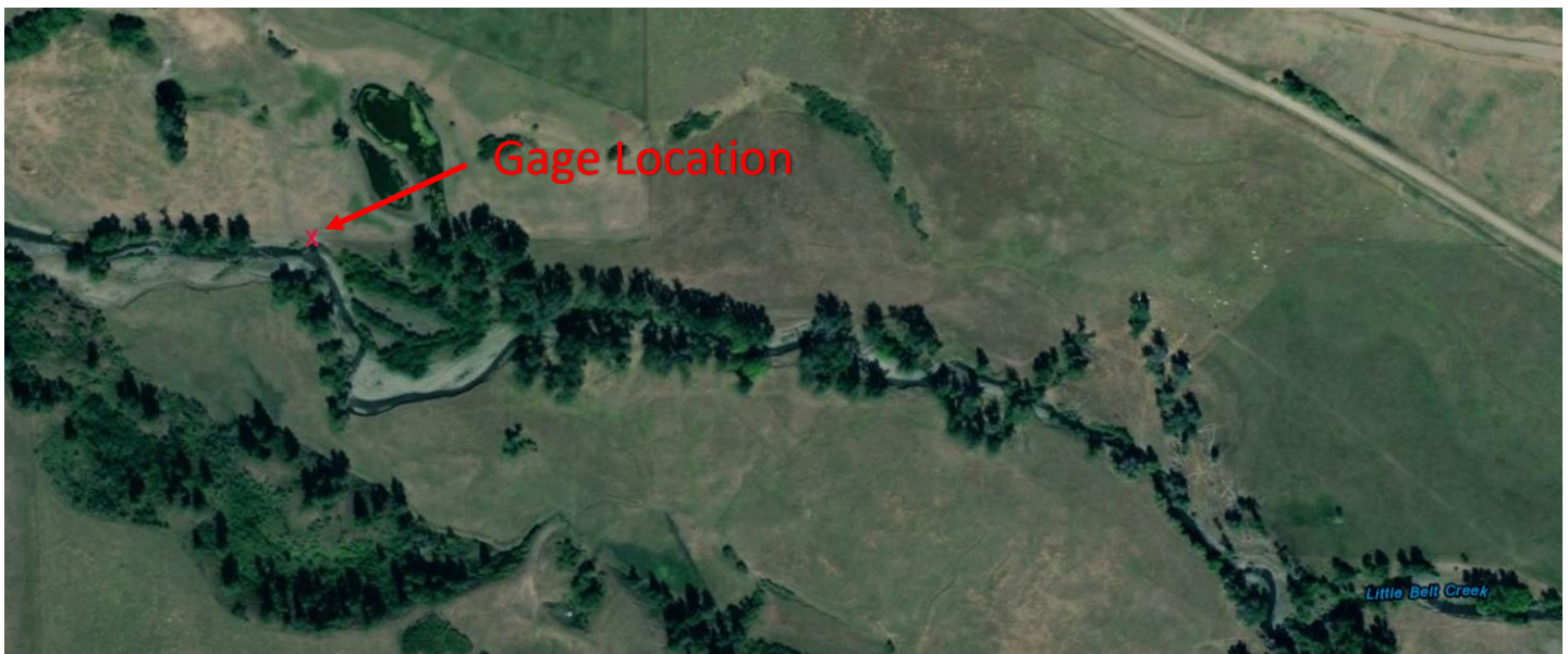
Fig.1. Stream gage location on Little Belt Creek.

After high water began to recede in the spring of 2019, a stilling well, staff gage and water level logger were installed at the measurement point authorized by DNRC. The following figures show the gage location, staff gage attached to the stilling well and the control section on Little Belt Creek downstream of the gage.