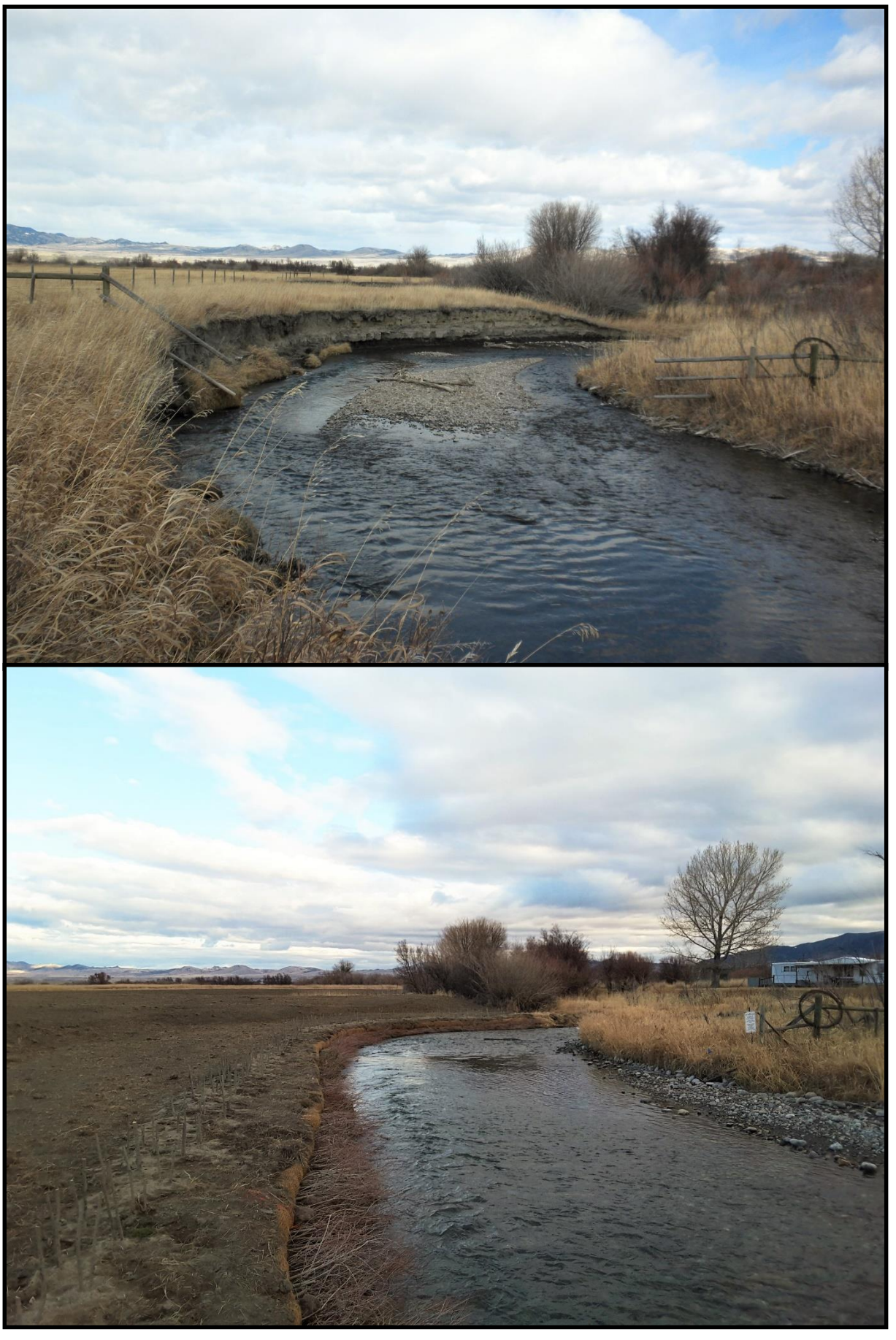
Top photo: (Before) April 6, 2017. Bottom photo: (After) November 13, 2019