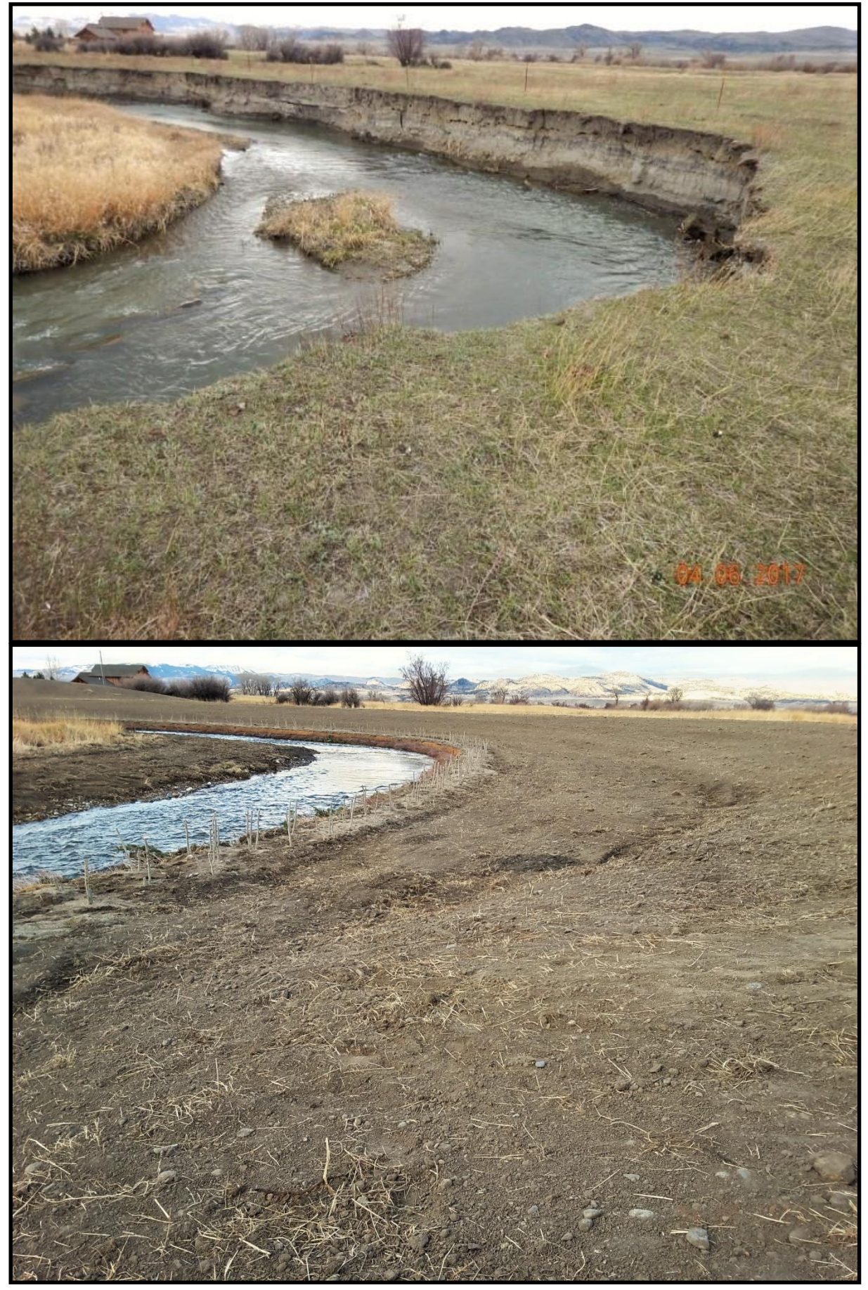
Site 5: Looking Upstream

Top photo: (Before) April 6, 2017. Bottom photo: (After) November 13, 2019