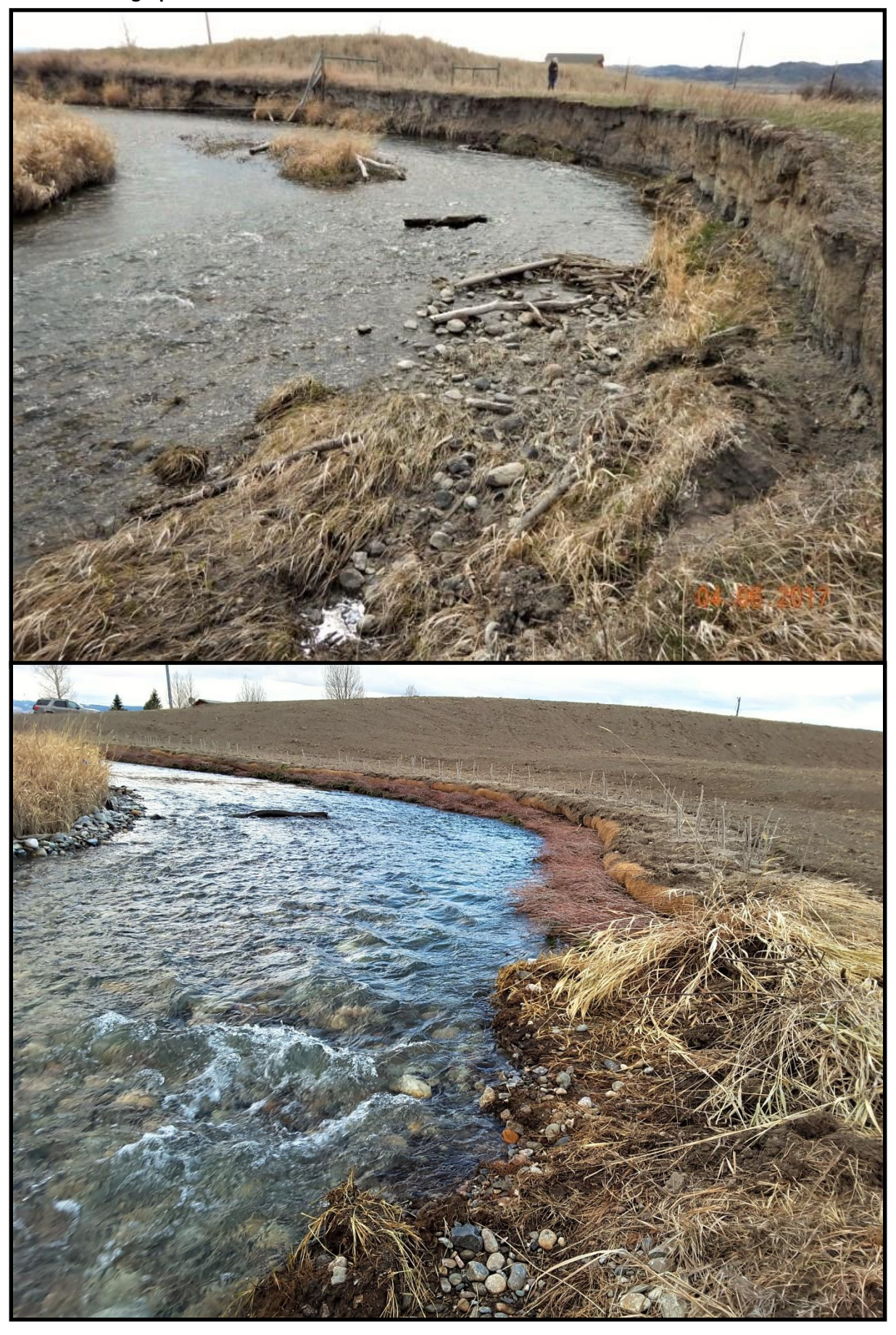
Site 4: Looking Upstream

Top photo: (Before) April 6, 2017. Bottom photo: (After) November 13, 2019