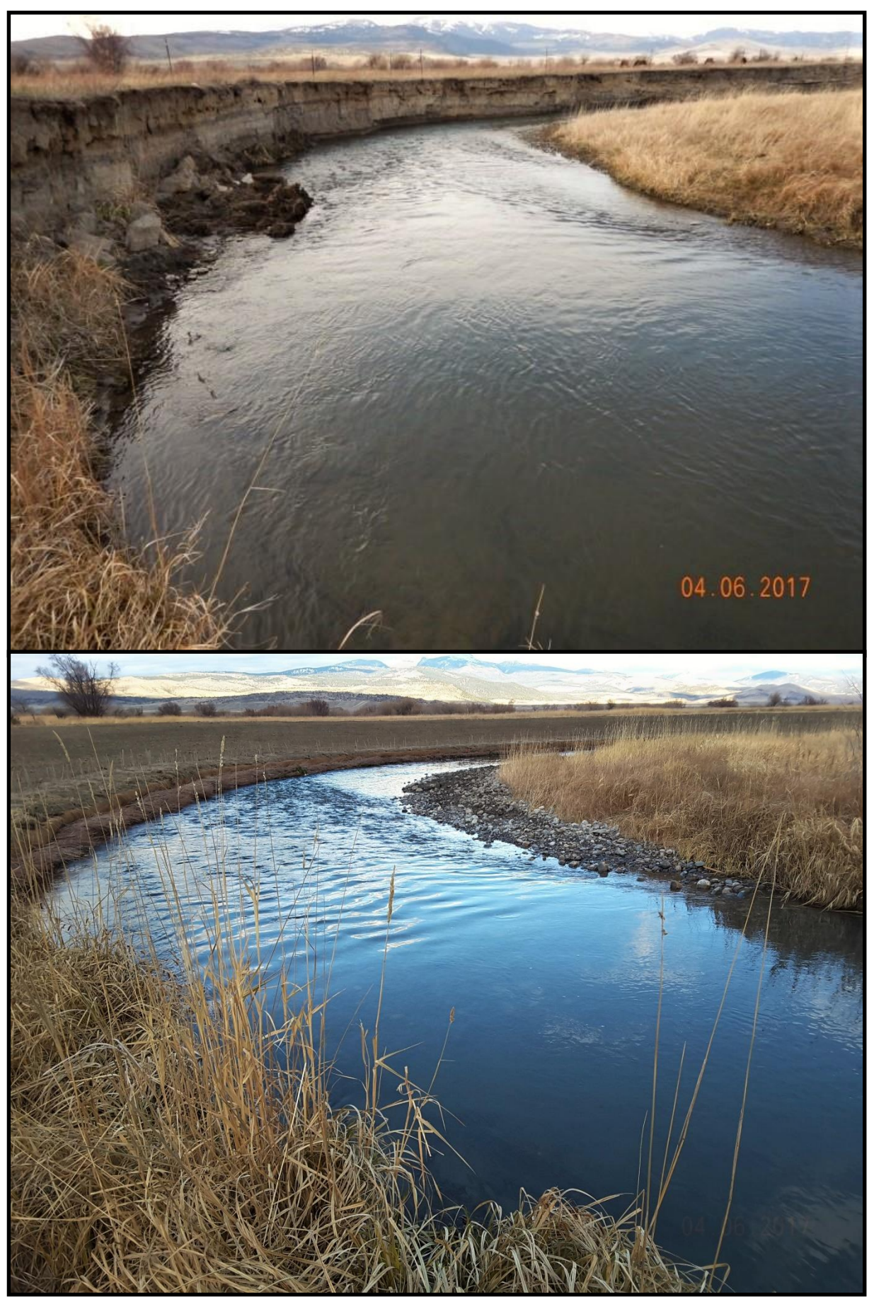
Top photo: (Before) April 6, 2017. Bottom photo: (After) November 13, 2019