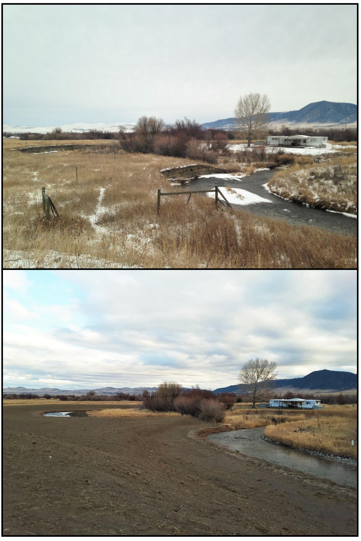
Site 4: Looking Downstream

Top photo: (Before) April 6, 2017. Bottom photo: (After) November 13, 2019