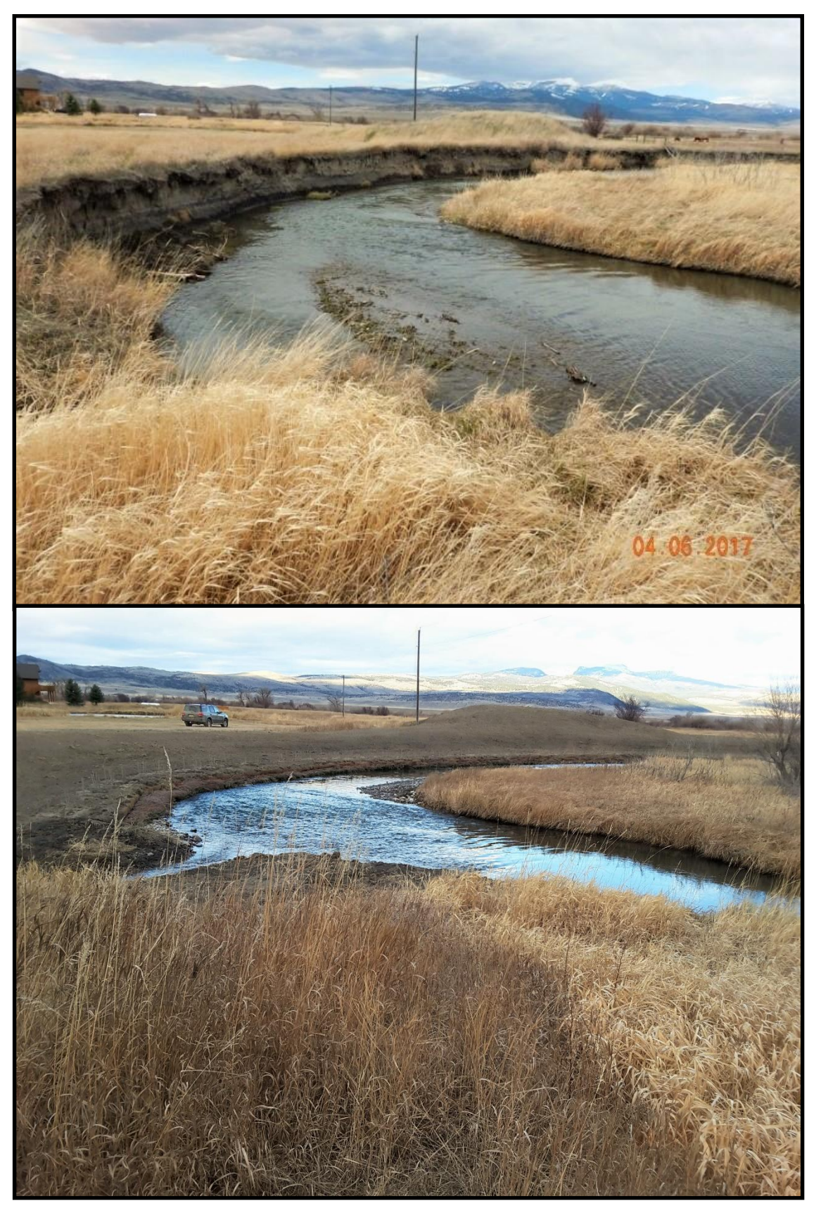
Top photo: (Before) April 6, 2017. Bottom photo: (After) November 13, 2019