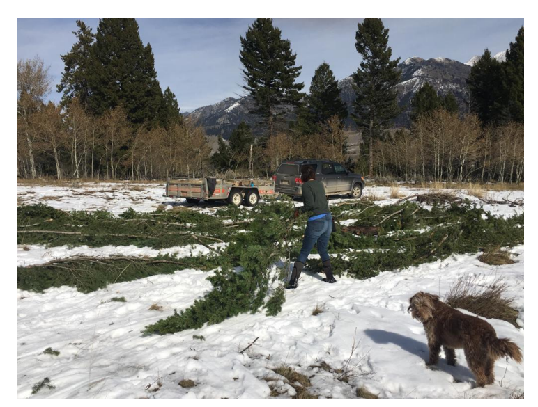
Attachment B: Photos - Volunteer Willow and Conifer Harvest