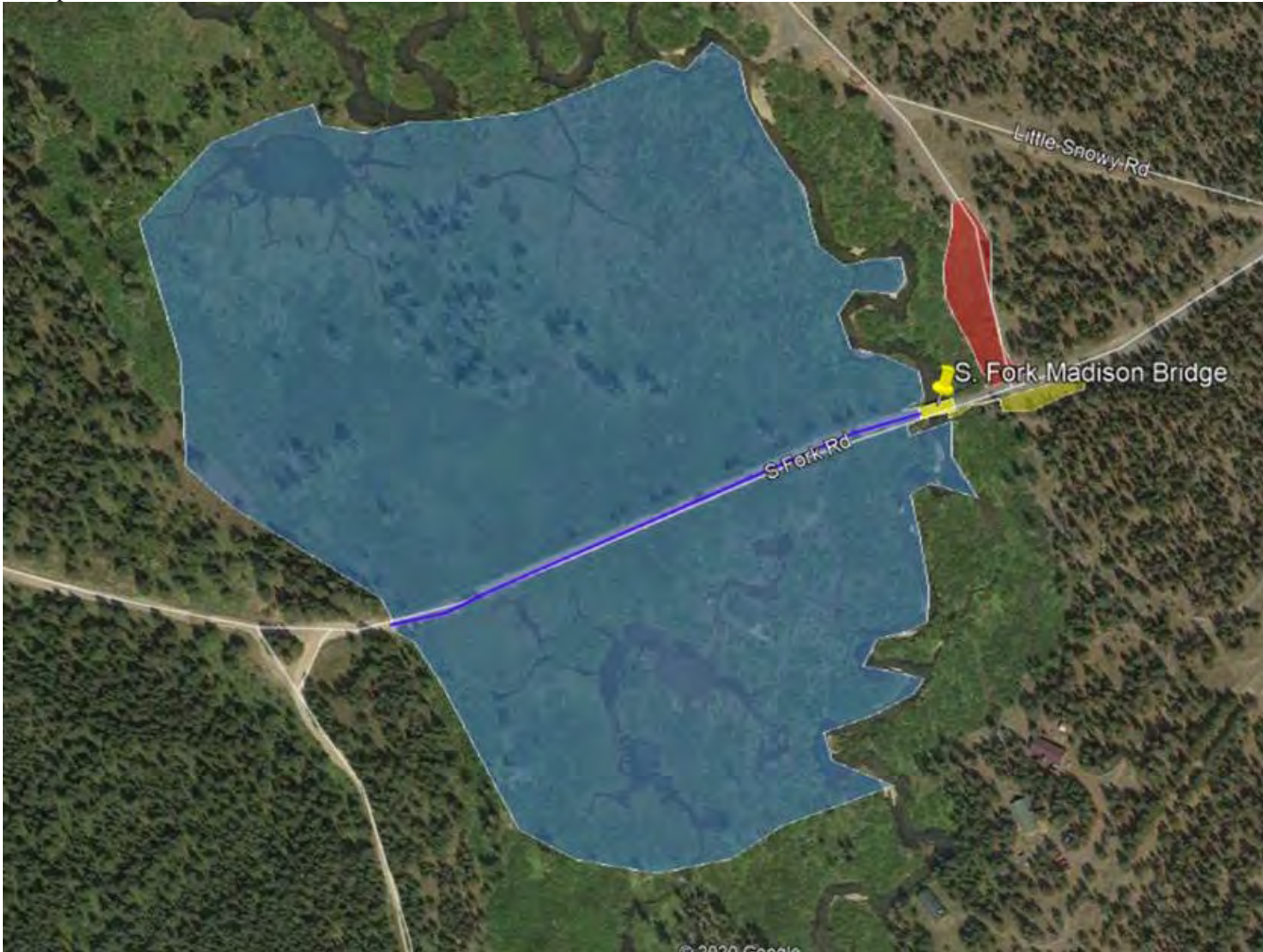
Figure 1. Proposed location of South Fork Madison River floodplain reactivation and habitat improvement project. The blue polygon shows the estimated causeway impact area, the red polygon shows the area of road with sedimentation impacts to be rebuilt, the yellow polygon shows the proposed improved parking area, and the dark blue line shows the length of the causeway across the floodplain of the South Fork Madison River.

from the lake. Reconnecting the South Fork Madison with its entire flood plain would increase its ability to maintain quality fisheries habitat and continue to support strong fisheries in both Hebgen Lake and the River itself.