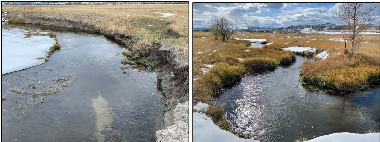
Figure 2. Impaired geomorphic and aquatic habitat conditions on Moore Creek, including high rates of bank erosion, simplified aquatic habitat conditions, and altered channel geometry (left photo). Reference conditions on lower Moore Creek include lower width-to-depth ratio channel geometry, stable streambanks supported by emergent wetland vegetation, and complex aquatic habitat features including runs and pools (right photo).

The project area includes approximately five miles of Moore Creek, tributary channels and springs, and prior converted wetlands. Moore Creek has been impacted by livestock grazing, channelization, ditching, and agricultural practices that have led to stream incision, entrenchment, high rates of bank erosion, and compromised aquatic and wetland habitats. In the mid-1900's, a four-mile-long drainage ditch was constructed on the west side of the valley to intercept springs and seeps to drain emergent and scrub-shrub wetlands. The ditch was subsequently plugged to create open water wetlands. These efforts were mostly unsuccessful, and the current ditch system and open water features provide marginal wetland functions and values and continue to alter wetland hydrology.