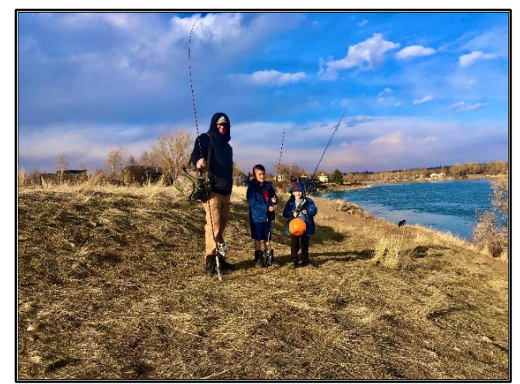
Figure 8. A family fishing trip close to home on the proposed park easement.