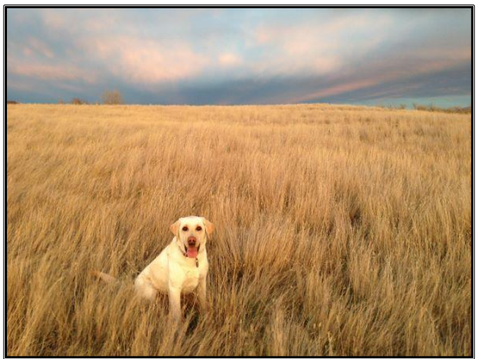
Figure 6. Upland area – a place to train and let dogs run and a quick hike.