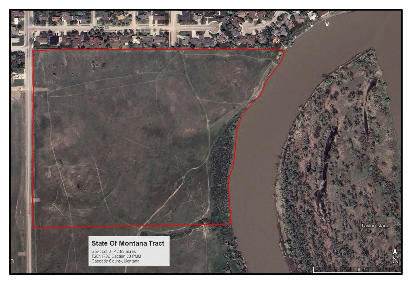
Figure 4. Aerial photo showing the approximate boundary (red polygon) of Government Lot 6 (Phase 1).