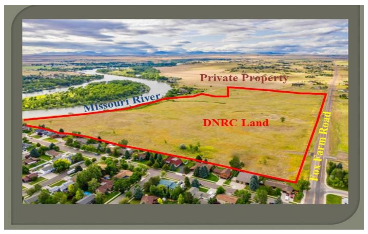
Figure 1. Aerial view looking from the north to south showing the total proposed easement area (Phases 1 and 2).