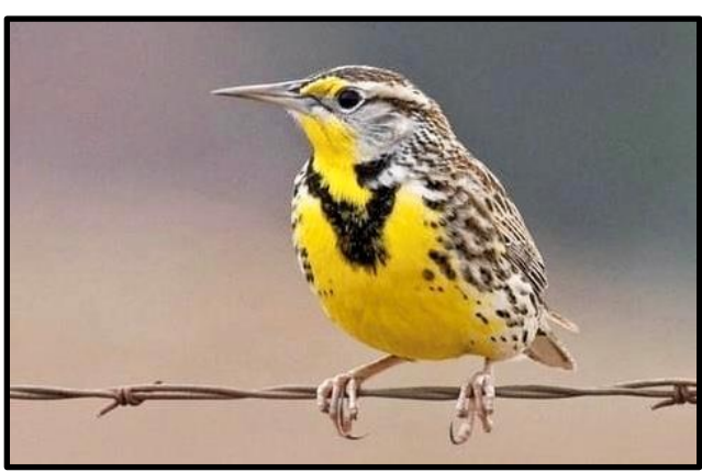
Figure 9. Watchable Wildlife in their habitat utilize this undeveloped land.