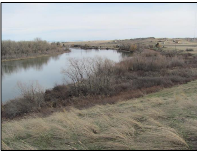
Figure 7. Proposed Public Park Area showing most of the riparian area.