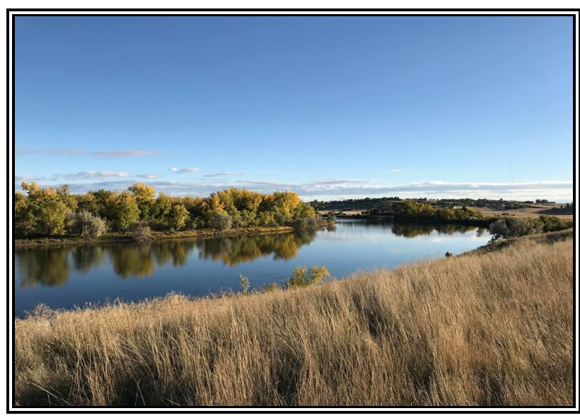
Figure 5. Missouri River front showing the Missouri River and some of the riparian area.