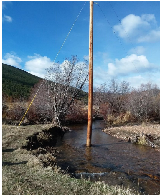
Figure 6. Another example of stream banks in the project area.