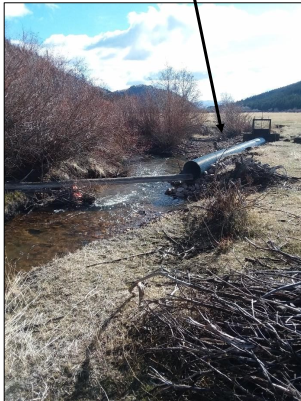
Figure 3. Current status of the point of Diversion.