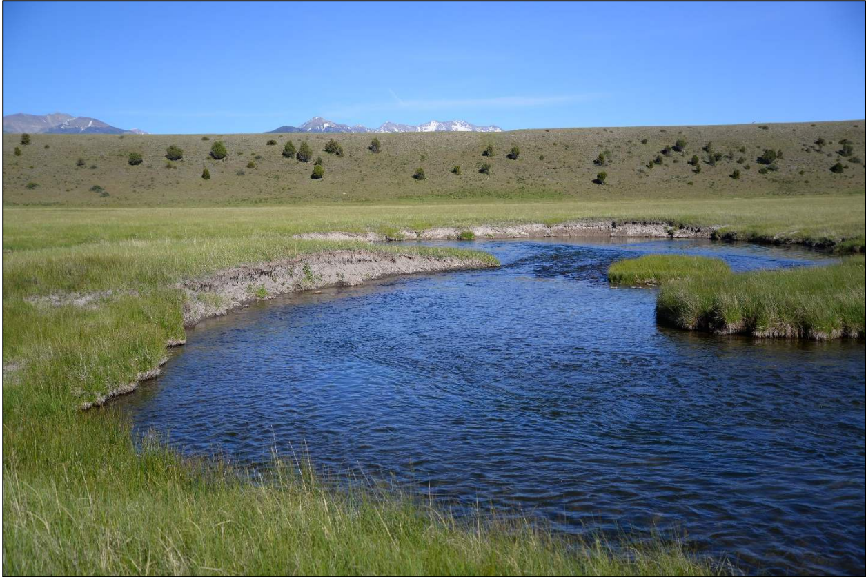
Figure 2. Typical channel and floodplain conditions in the Phase 20 project area.